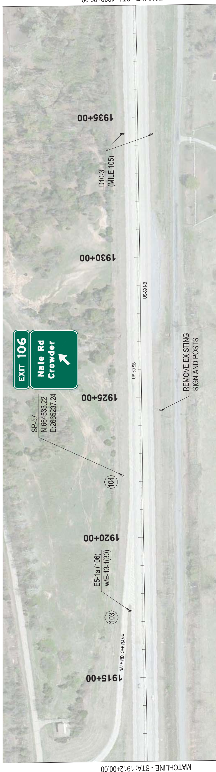
MATCHLINE - STA: 1912+00.00