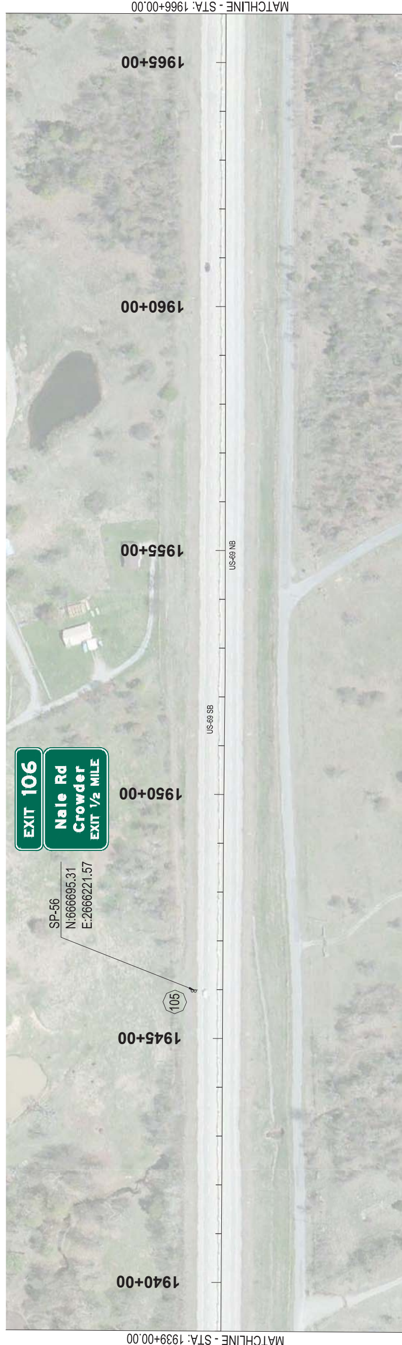
MATCHLINE - STA: 1939+00.00